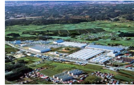
Tochigi Plant (Yaita, Tochigi)