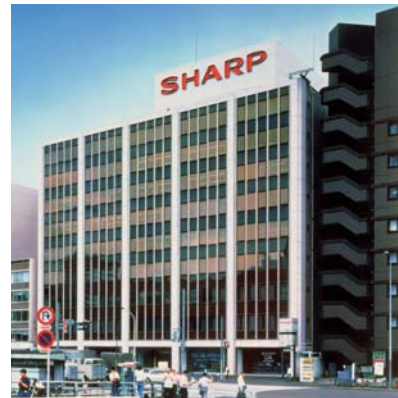
Tokyo Ichigaya Building (Shinjuku-ku, Tokyo)