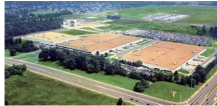
SMCA, manufacturing division of SEC