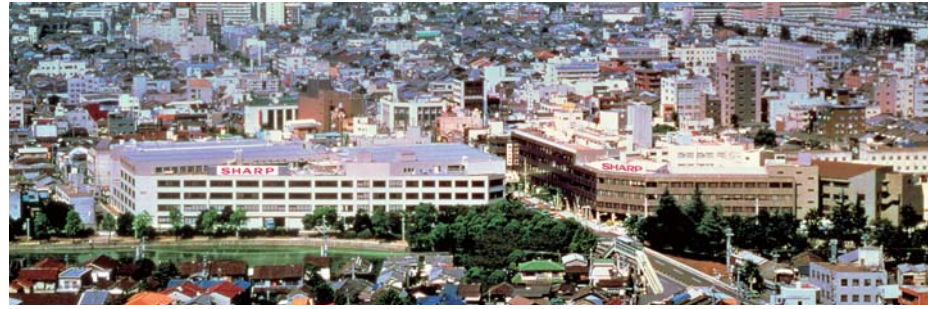
Head Office (Abeno-ku, Osaka)