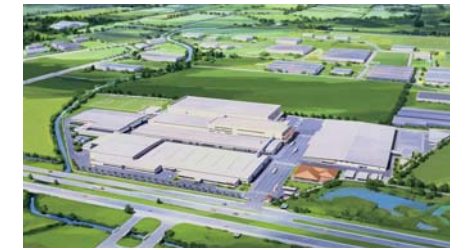
Manufacturing company SATL in Thailand