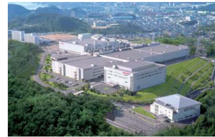
Fukuyama Plant (Fukuyama, Hiroshima)