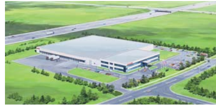
Sales company SECL in Canada