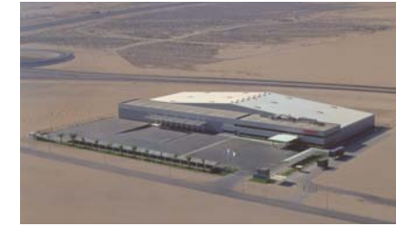
Sales company SMEF in the UAE