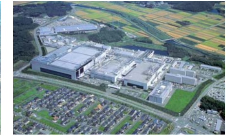
Mie Plant (Taki, Mie)