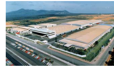
Manufacturing company SMM in Malaysia