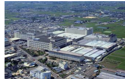
Nara Plant (Yamato-koriyama, Nara)