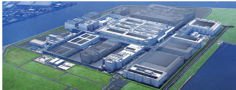
Green Front Sakai (Sakai, Osaka)

The area within the dashed lines and the rooftop solar panels are conceptual renderings showing the appearance when finally completed.