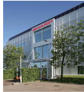
Sales company SUK in the UK