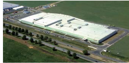
Manufacturing company SMPL in Poland