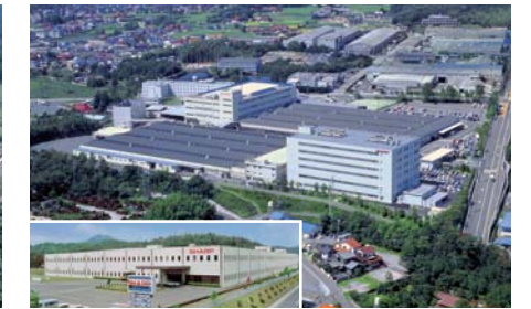
Hiroshima Plant (Higashi-hiroshima, Hiroshima)