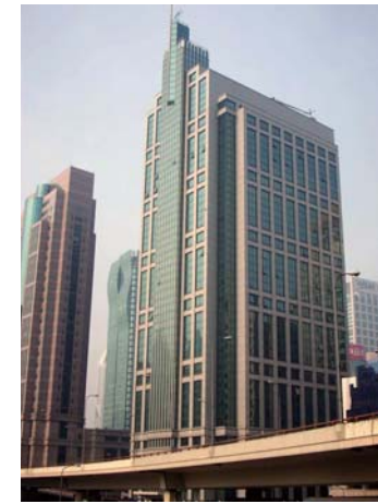
Sales company SESC in China