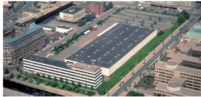
Sales company SEEG in Germany