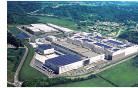
Kameyama Plant (Kameyama, Mie)