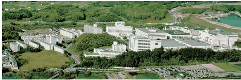
Advanced Development and Planning Center (Tenri, Nara)