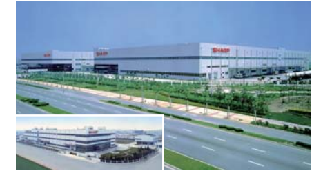
Manufacturing company SSEC in China