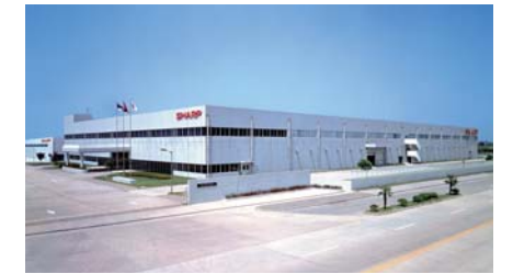
Manufacturing company SOCC in China