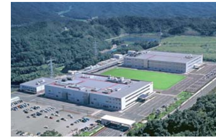
Mihara Plant (Mihara, Hiroshima)