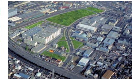
Yao Plant (Yao, Osaka)