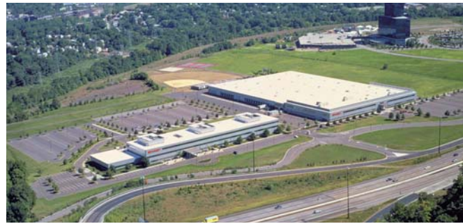
Sales company SEC in the US