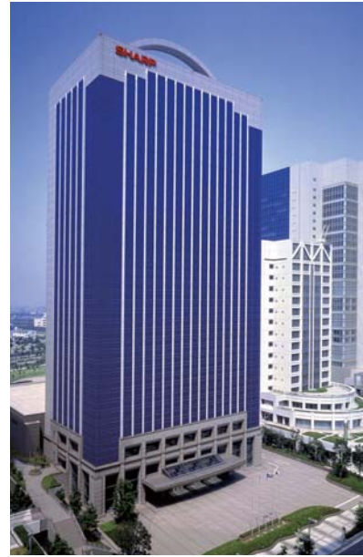
Tokyo Branch (Makuhari Building) (Mihama-ku, Chiba)

The area within the dashed lines and the rooftop solar panels are conceptual renderings showing the appearance when finally completed.