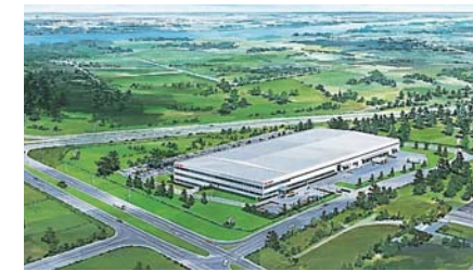
Sales company SCA in Australia