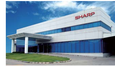
Sales and manufacturing company SEID in Indonesia