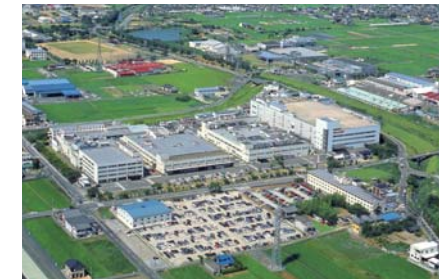
Katsuragi Plant (Katsuragi, Nara)