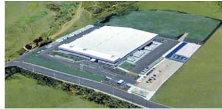
Manufacturing company SEMEX in Mexico