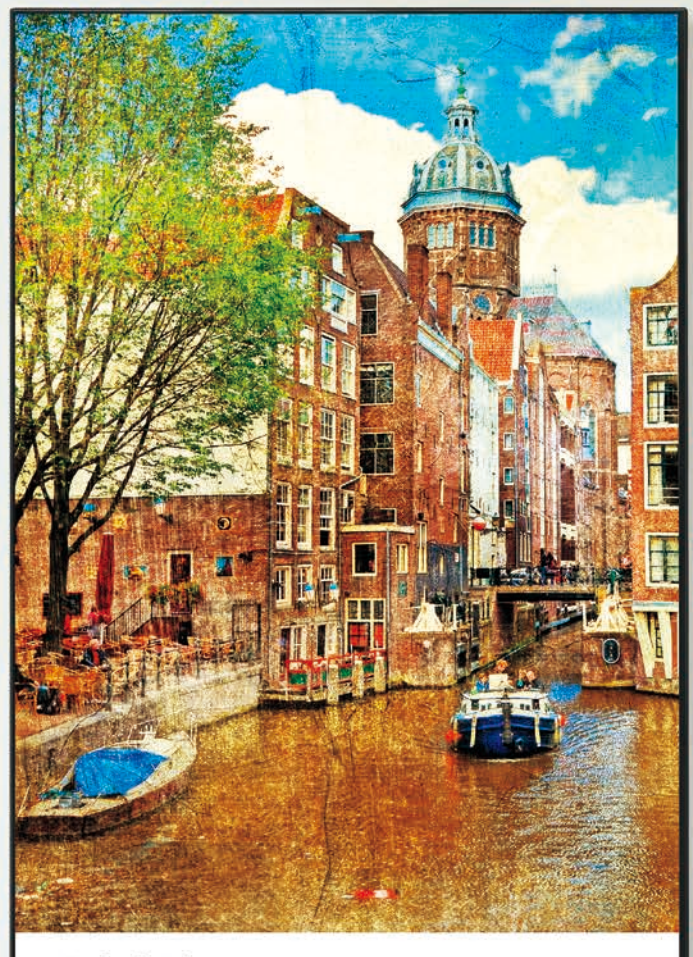
Emilie de Vabres (b. 1966)